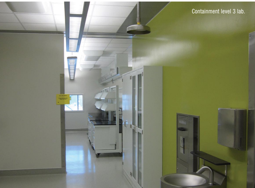
Containment level 3 lab.