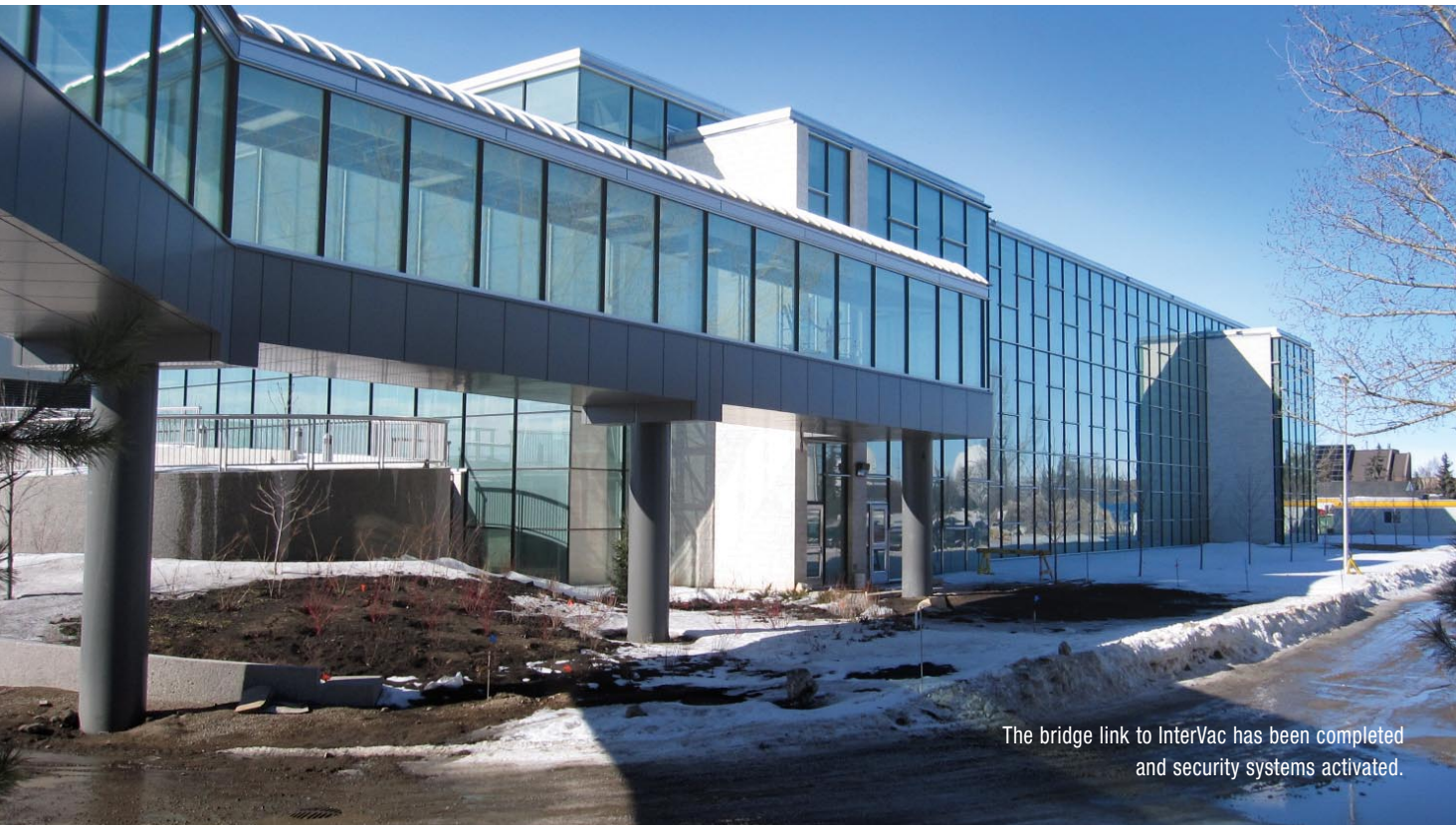
The bridge link to InterVac has been completed and security systems activated.