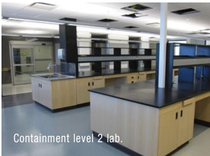
Containment level 2 lab.