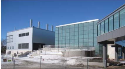
Above: Construction related to the exterior is complete. Final landscaping will proceed after work on the steam tunnel is completed.